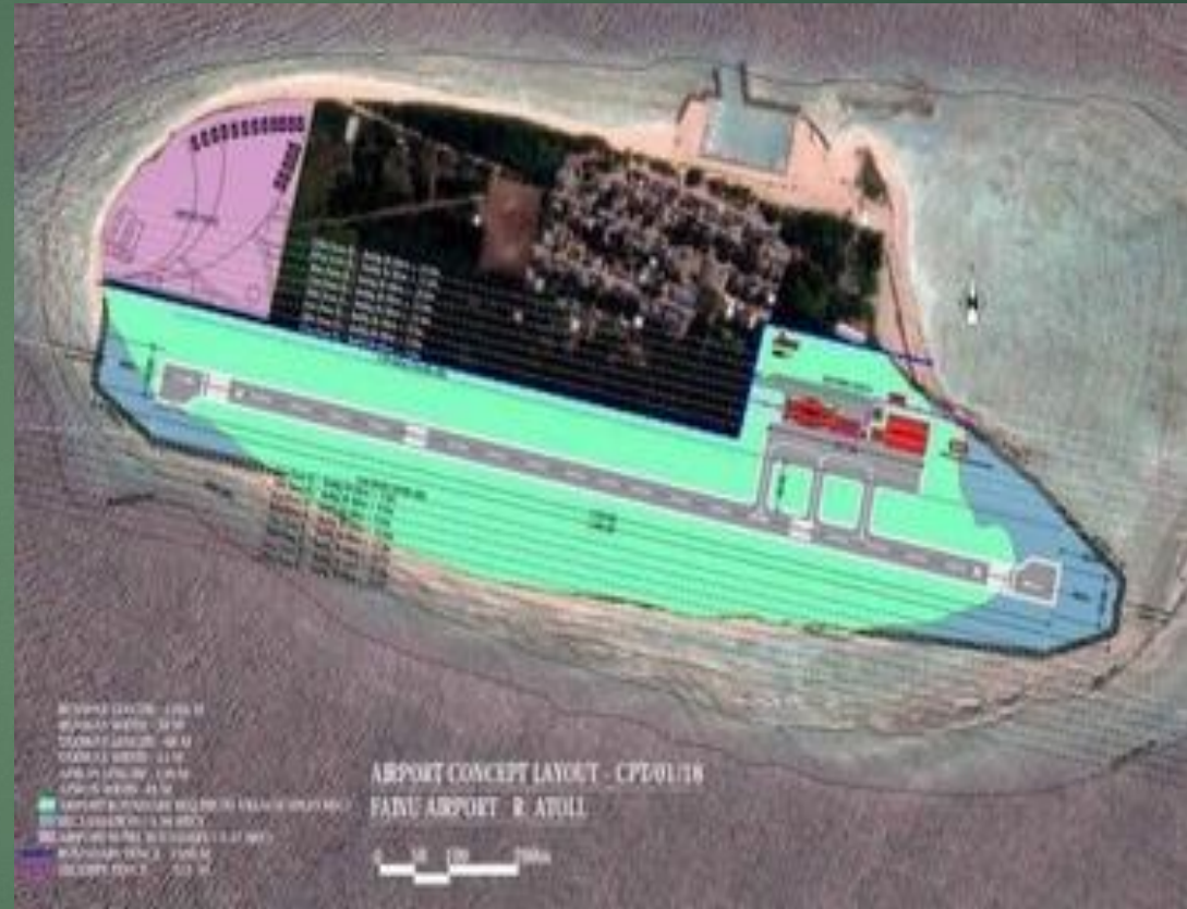
Fainu Airport Concept Layout